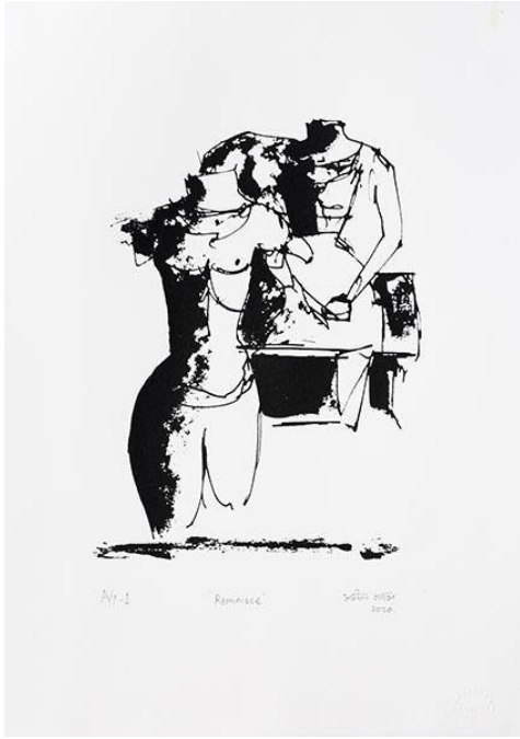
By Anil Vyas