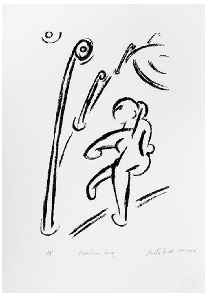
"Freedom Song" by Anita Dube