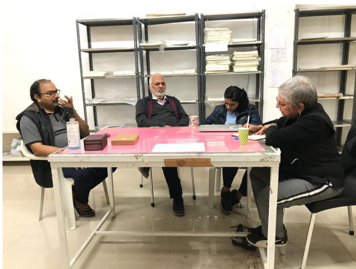
Writing notes: Pre and Post Production