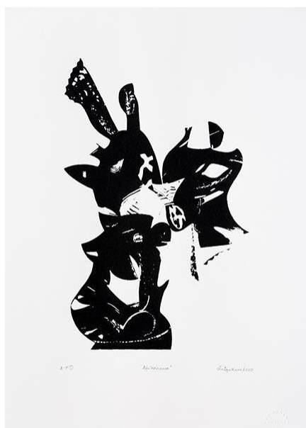
By Satyakam Saha.