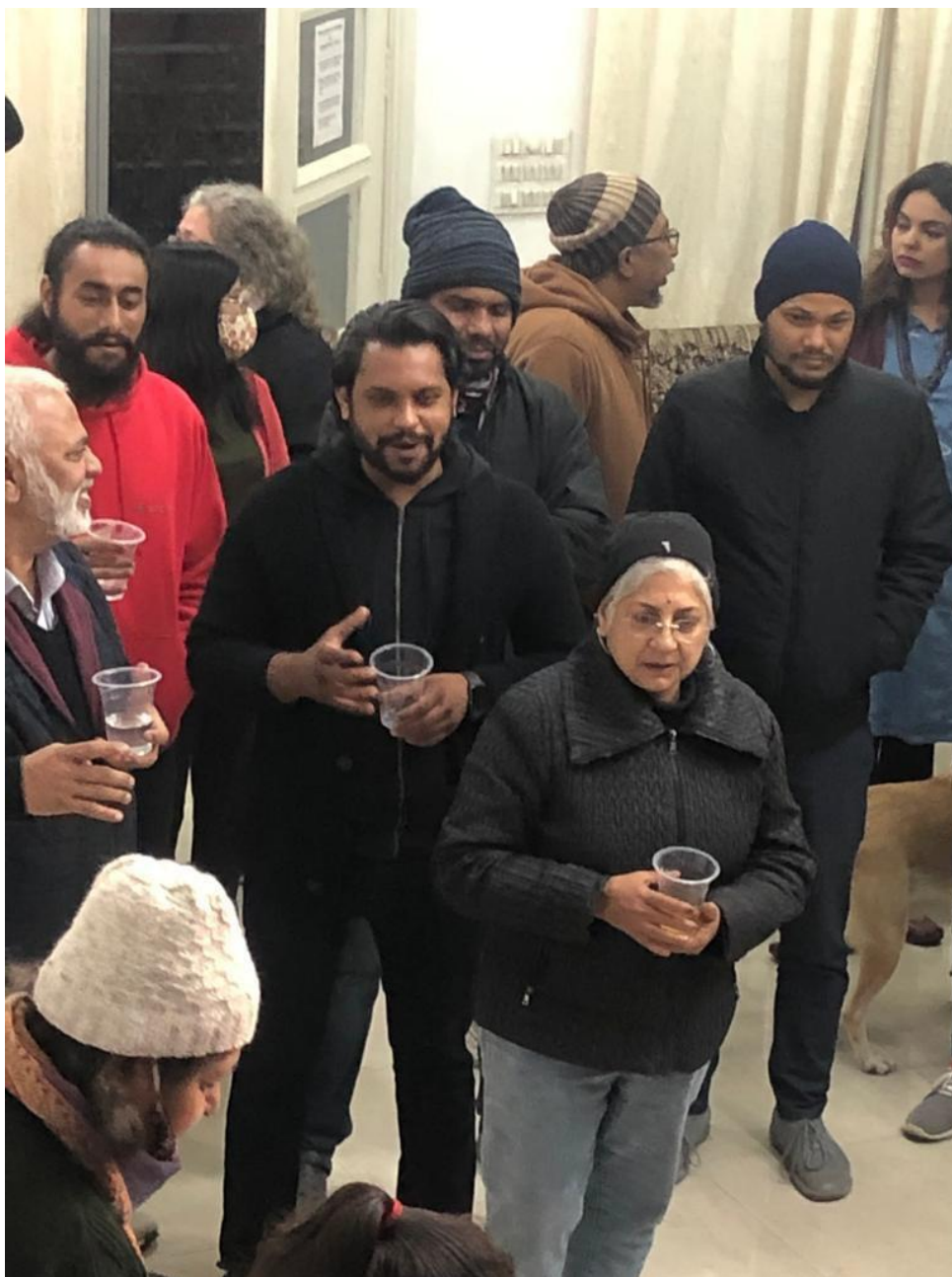
An image from the Printing Completion Party at Studio No. A 67.