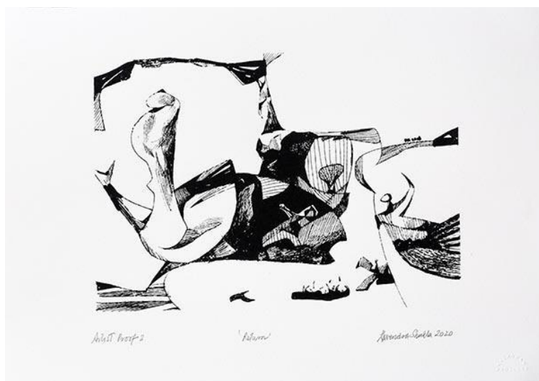
“Return” by Devender Shukla