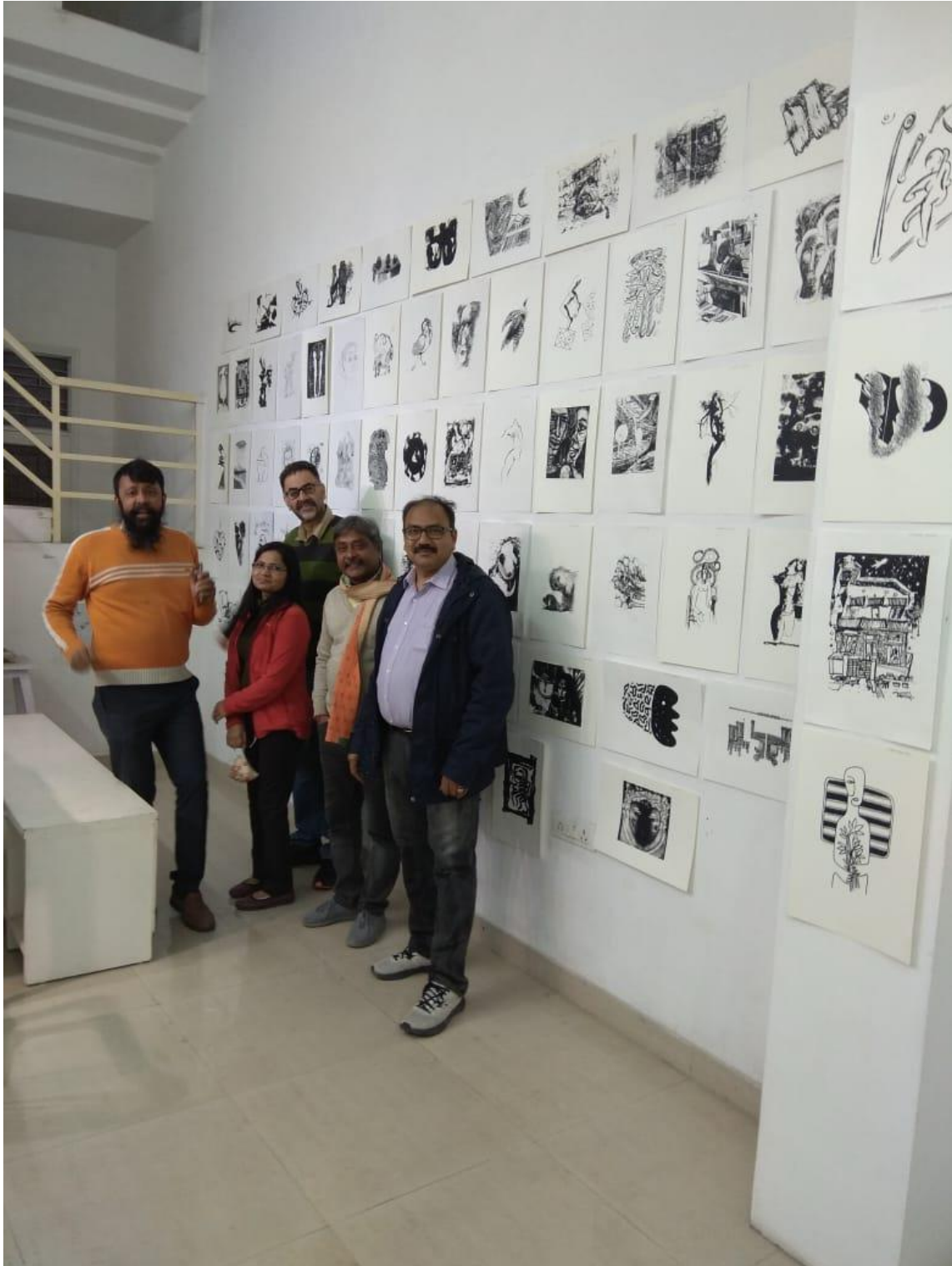
Display of the proof prints